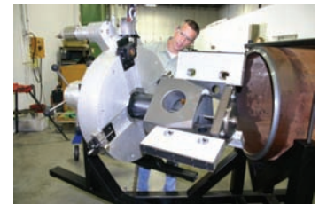
Only eight sets of clamps and two wedges required to cover entire range. Simple to operate, quick to set up.

The Terminator is shown with a 5 h.p. pneumatic motor and off-set gear drive that can also be used with the available hydraulic drive.