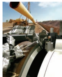
Formed tool bits for wall thicknesses in excess of 2.5in.