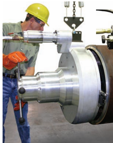
36" pipe has never been easier to end prep. Quick set-up, precise alignment and patent pending safety lanyard.

The Terminator is shown with a 5 h.p. pneumatic motor and off-set gear drive that can also be used with the available hydraulic drive.