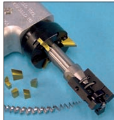
"Tube Weasel" features the rigid EscoLock blade lock system and titanium nitride coated cutter blades which combine to pull a thick continuous chip on all types of tube and pipe without cutting oils.

The ESCO "Tube Weasel" MILLHOG® is a lean, extremely durable tool that performs end preps on all boiler tube alloys quickly and efficiently. Featuring a right angle gear head drive system which incorporates dual opposed tapered roller bearings, this compact tool provides a big bite with a small appetite because it requires only (25 cfm), 708 lt./min of air to pull a heavy continuous chip.