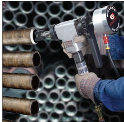
The "Air Clamp" Tube Weasel MILLHOG® is ideal for production applications and takes only minutes to convert from a manual clamping end prep tool to one of the fastest clamping tools on the market.