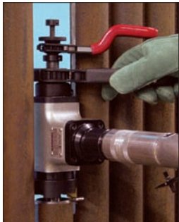
The "Tube Weasel" fits a Dutchman window for single tube end prep work and totally sealed construction allows it to be used in any orientation. Most importantly, the holding clamps are designed to stay on the mandrel and not fall down the tubes.